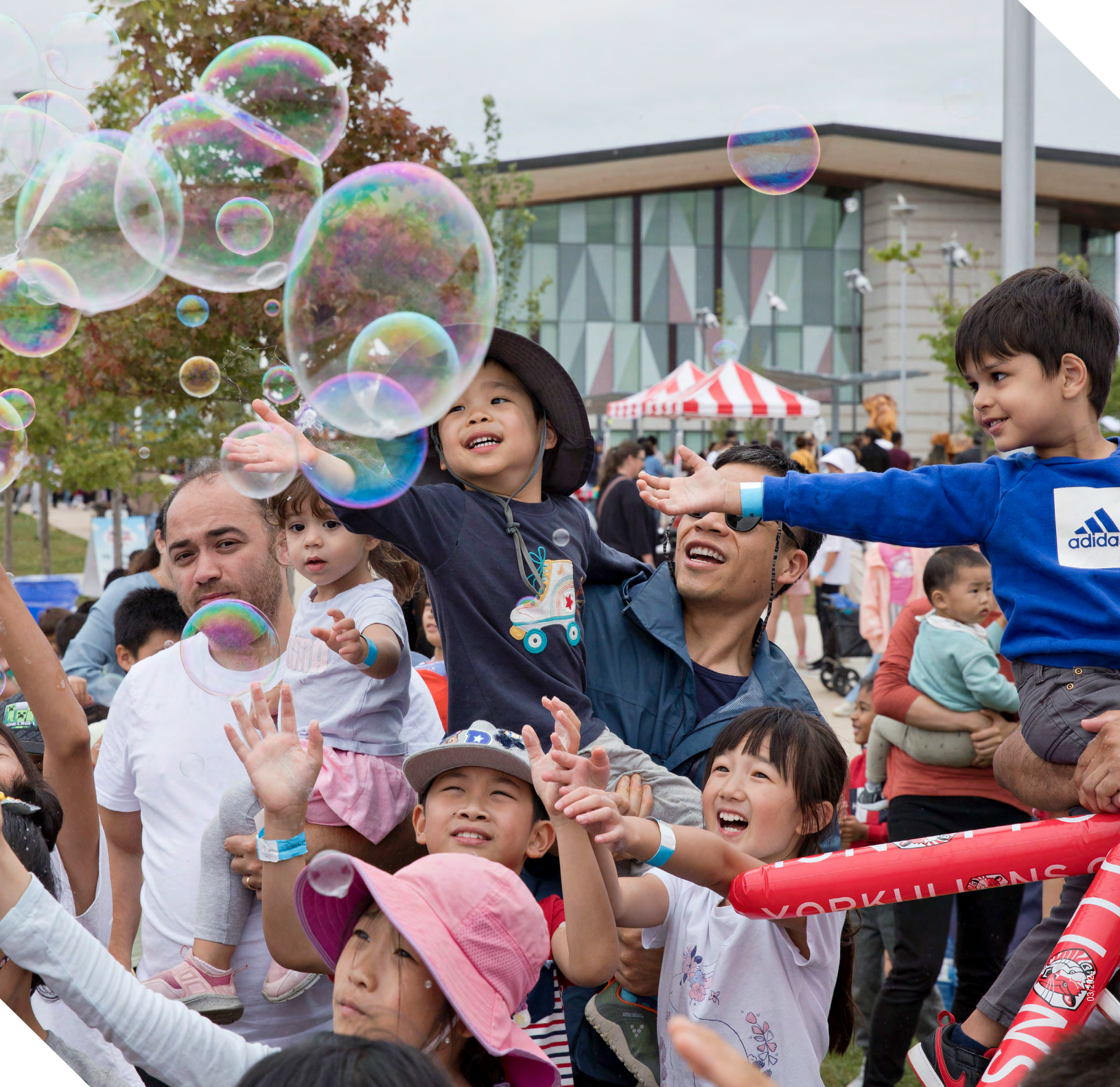
Markham-Milliken Children's Festival, a Top 100 Event in Ontario for 2024, took place outside of Aaniin Community Centre on September 9, 2023.

101 Town Centre Blvd., Markham, ON, L3R 9W3 905.477.5530 | customerservice@markham.ca markham.ca/StrategicPlan