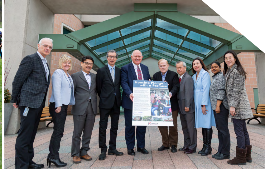
Markham Centre Trails (left); and Markham signed municipal Housing Pledge on March 22, 2023 (right).