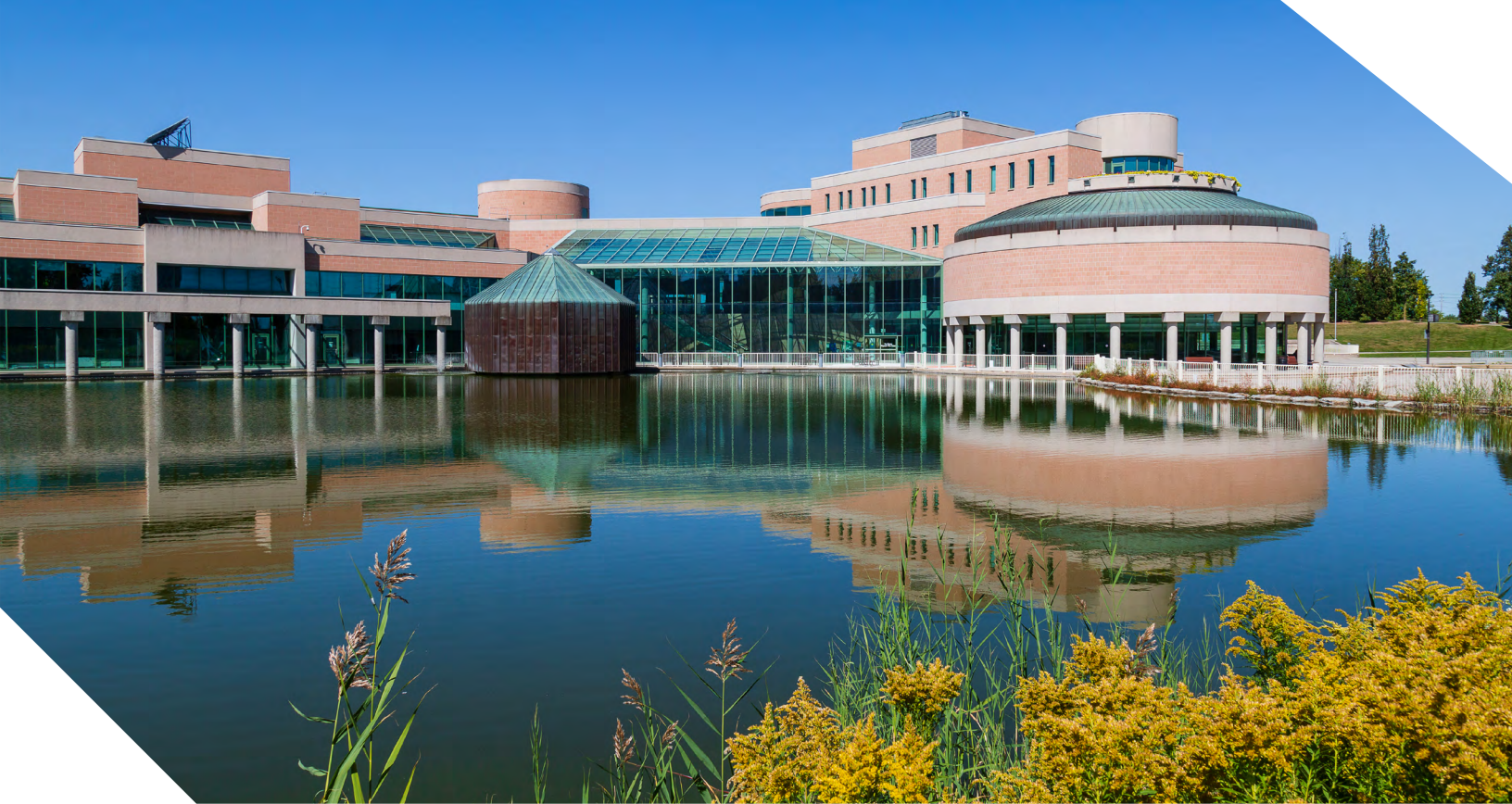
Markham Civic Centre and reflection pond.