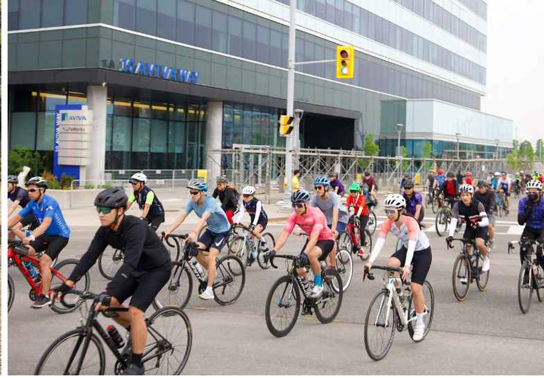
Austin Dr. Mini Forest tree planting (left); and 2023 Markham Cycling Day (right).