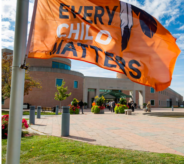
Canada Day celebration (left); Standing in the Doorway exhibition at Markham Museum (middle); Every Child Matters flag was raised at Markham Civic Centre in recognition of the National Day for Truth and Reconciliation and Orange Shirt Day (right).